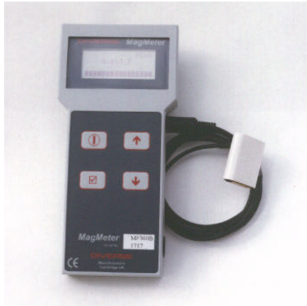
MF300B AND FLUX PROBE