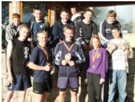
361 Cross Country Team with Awards