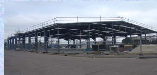
A Parish Plan for Williton

Other ideas arising from Parish Consultation • Liaise with accommodation providers to investigate the potential of increased bed spaces within Williton