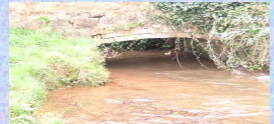
A Parish Plan for Williton