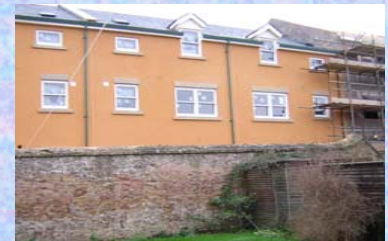
A Parish Plan for Williton

Other ideas arising from Parish Consultation • Concerns surrounding the high proportion of RSL housing currently in Williton