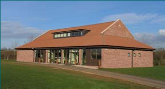
Concept of how a community building might look