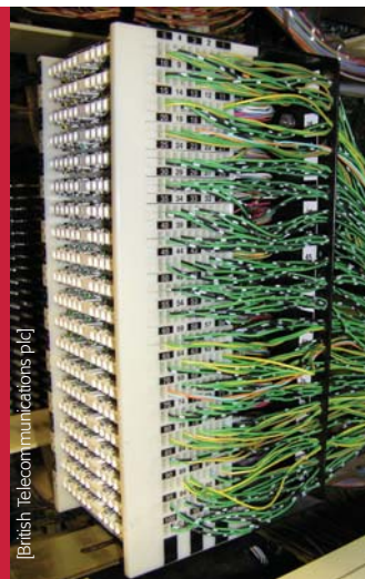
The termination block of an external cable on the main distribution frame at an exchange. The various colours of jumper wire carry different services such as broadband ADSL and ISDN as well as the normal telephone service

Networks based on telephone cables are inherently self-disciplined by cross-talk between circuits. This is emphasised by the need for co-existence in the same cable between different technologies providing different services and, with local loop unbundling, different service providers. This discipline is provided by European and global xDSL product standards and the UK Access Network Frequency Plan. Accordingly national or international EMC regulations are of only secondary importance.