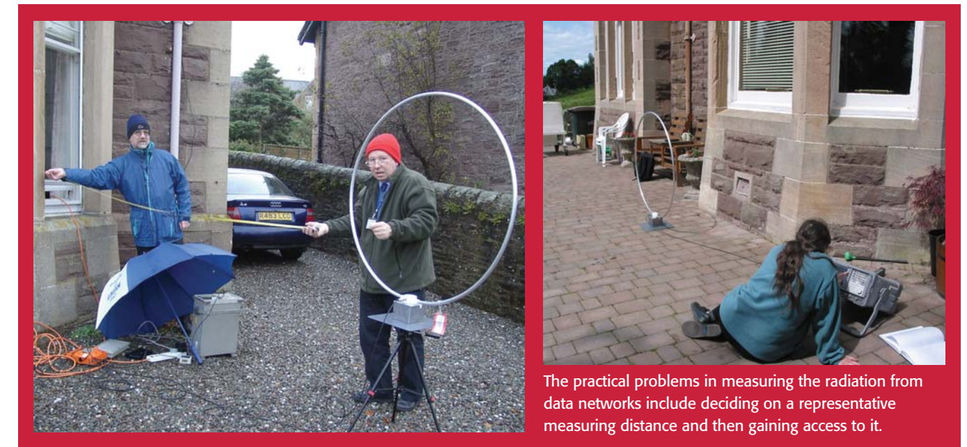
The practical problems in measuring the radiation from data networks include deciding on a representative measuring distance and then gaining access to it.

Broadband xDSL (ADSL and VDSL) was subject to thorough discussion in the UK which resulted in the draft national standard MPT1570. In Germany, standard NB30 was formulated. The implementation of both