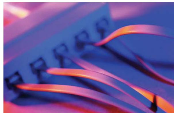
Local area networks are subject to the CISPR22 requirement that sets a limit on the common-mode voltage or current launched onto the cable. For disturbance converted by the cable itself from its differential-mode signal the standard allows a 10dB relaxation. This is to be reviewed in the light of experience.

Until computers appeared on every desktop, data networks were either very low-speed or they were carried on dedicated shielded cables. The original Ethernet local area network (LAN) for office deployment also used shielded cable and operated at 10Mbit/s, but this was quickly replaced by twisted pairs. At first these were operated at 10Mbit/s, but cable and line coding improvements coupled with market demand have made 100Mbit/s the norm and 1000Mbit/s is now available.